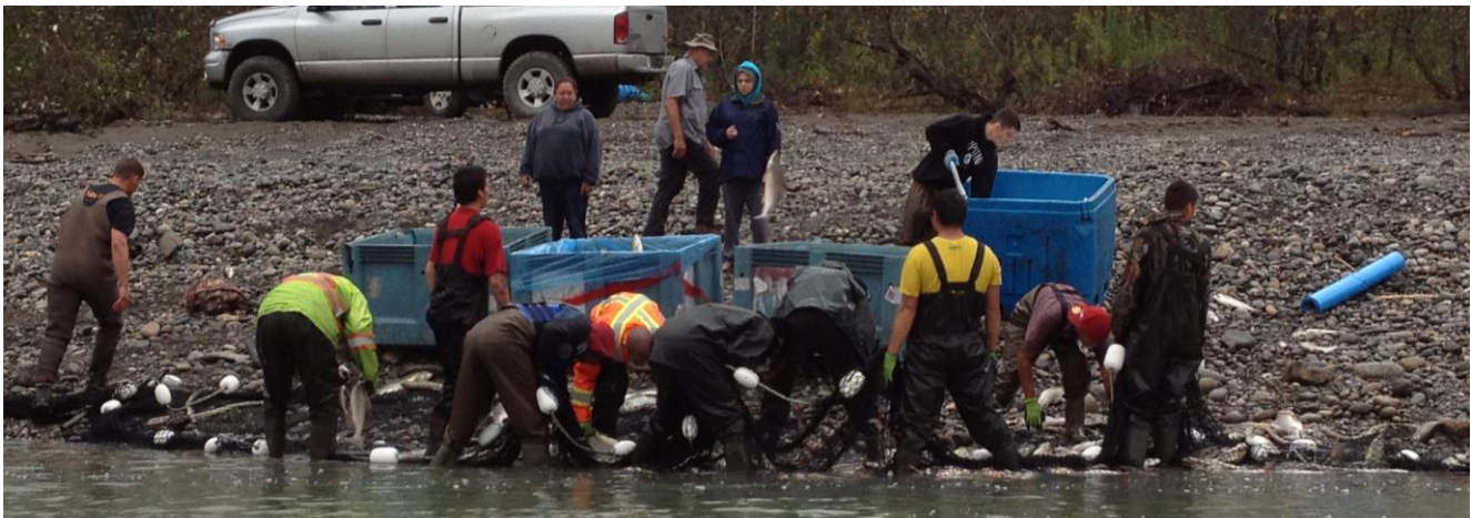
Photo: Economic fishery on the Lower Fraser – fall 2013

Registration for this session is required , and is now open. For more information or to register, visit the Science Series page on our website at http://www.fnfisheriescouncil.ca/news-events/fnfc-science-series .