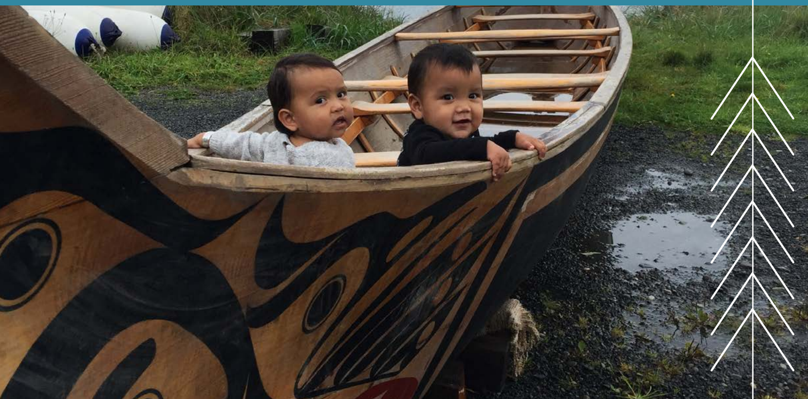
cousins in canoe, Skidegate, Haida Gwaii

Task Group participants (see Appendix A ) bring diverse experience in fisheries and aquatic habitat management, and are recognized for their expertise in guiding the conversation around UNDRIP implementation and reconciliation with Crown governments.