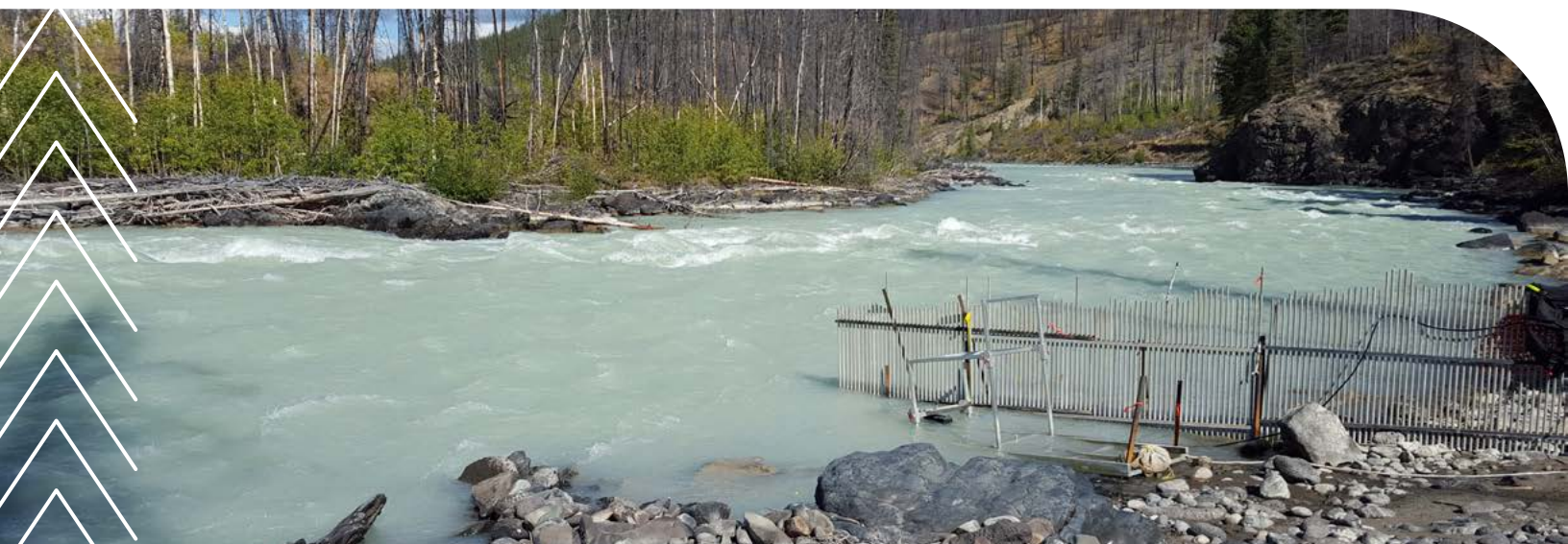
Taseko River

This paper seeks to provide a more detailed picture of UNDRIP implementation in the context of fish, fisheries, and aquatic habitat in BC, and it outlines specific recommendations to the provincial government to initiate the necessary reforms.